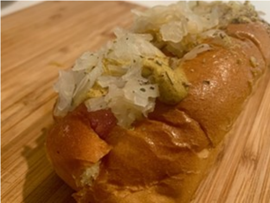
Sauerkraut and brown mustard on the New York dog for $6.50

Can the frank get wrapped in prosciutto? Can you crush Zapp's Voodoo chips and let them hail over the dog like a dangerous storm? Can you stack four dogs in two layers like the beginnings of a log cabin? "Have it your way," the online ordering system warns.