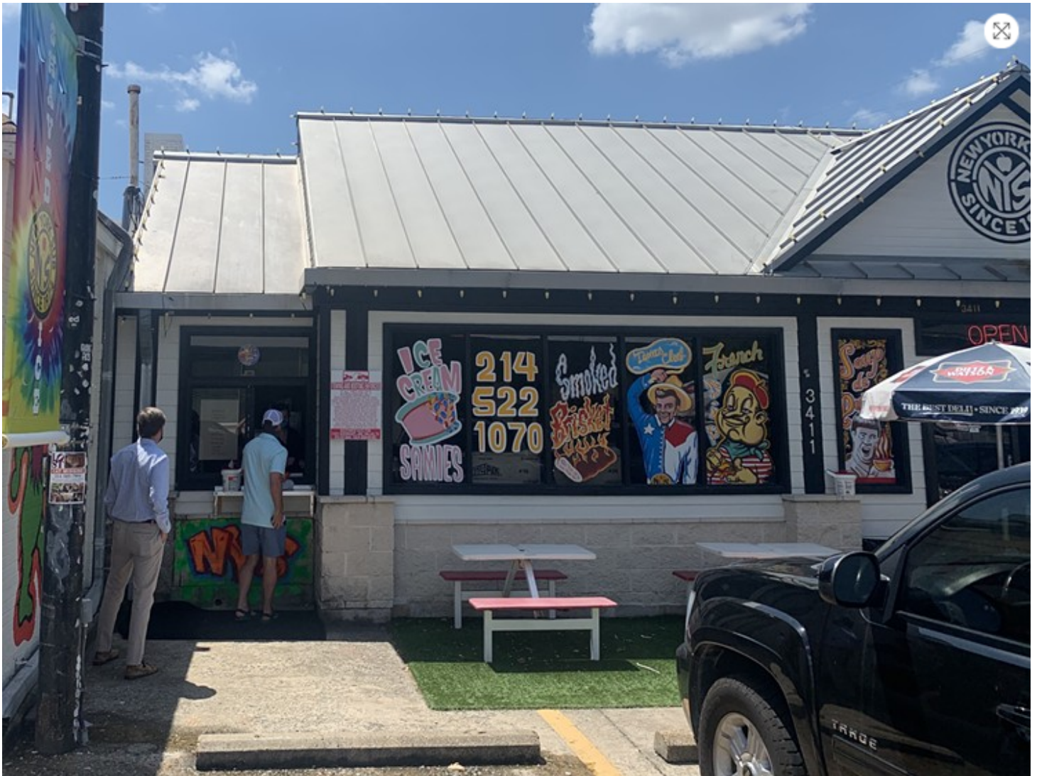
The shaved ice window is now open at New York Sub.