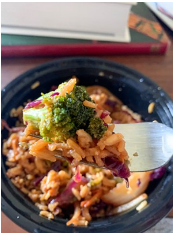
It’s spicier than it looks.

Less obvious on the menu is a dish that travels well: the Iron Fist ($7.99). It’s a bowl of fried rice with cabbage, carrots, broccoli, bell peppers, green onions and more of that bomb sauce. That sauce is perfectly suited for vegetables and makes this bowl addicting. The meal itself traveled well in a 15-minute car-ride home, and saving half of it for the following day’s lunch worked, too. (I throw it in a small glass dish with a bit of water, cover with foil and bake at 350 in the toaster oven for 15 minutes. It’s my usual process for reheating fried rice, and I endorse it.)