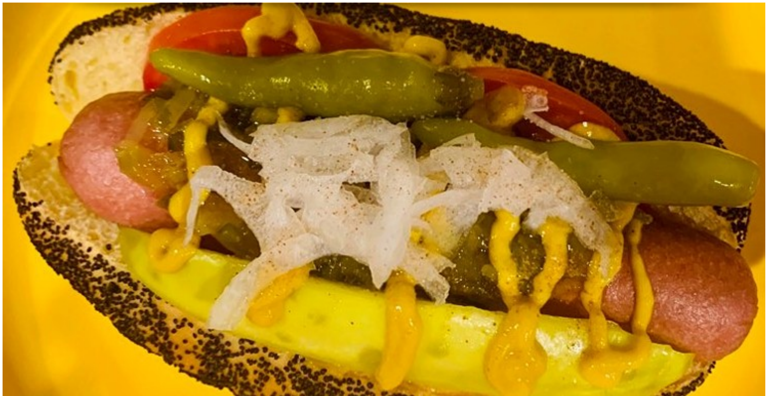
The Chicago dog with sport peppers and mustard for $6.50 / Andrew Kelley