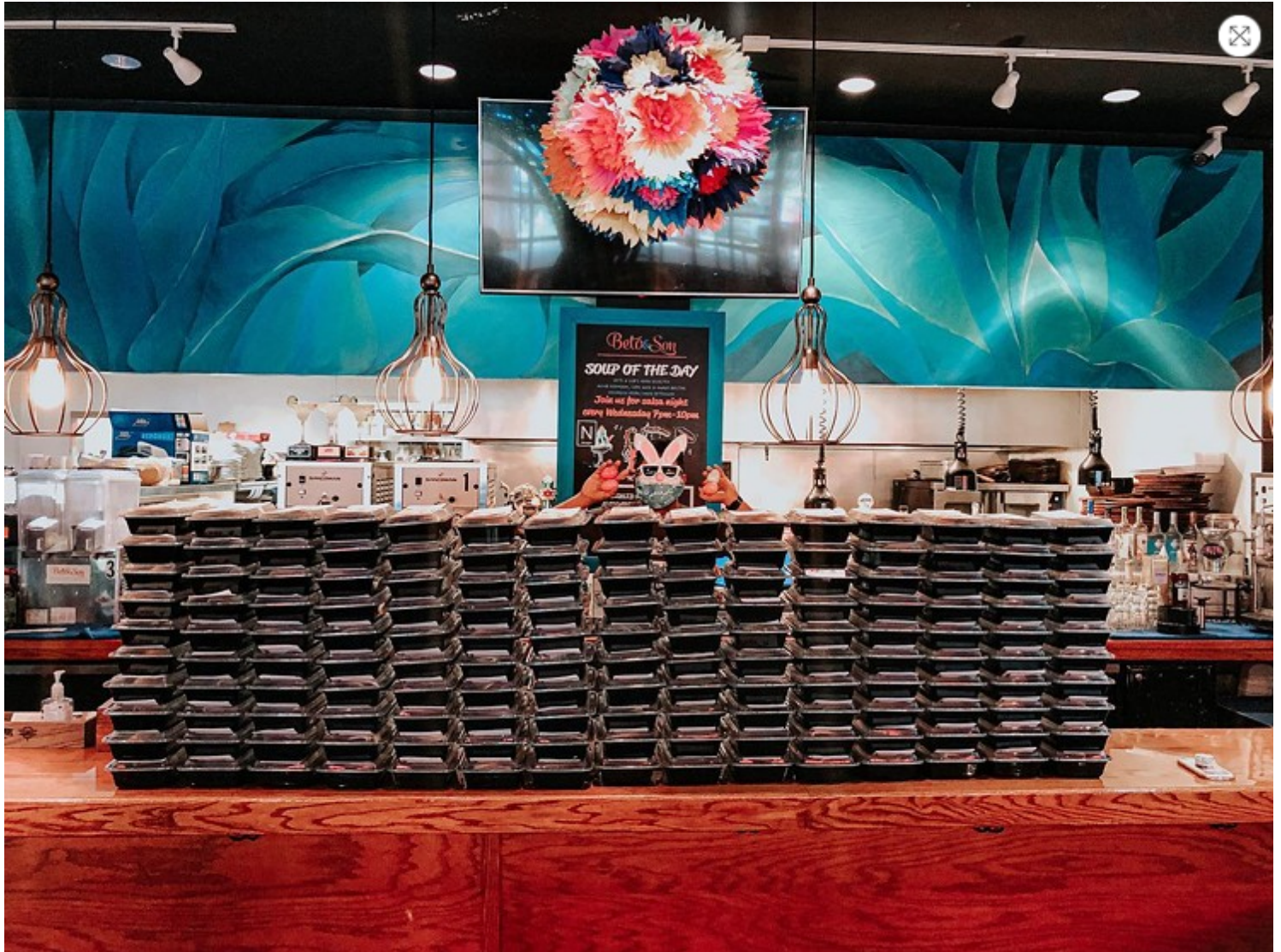
Meals ready to go to those who need them from Beto and Son in Trinity Groves